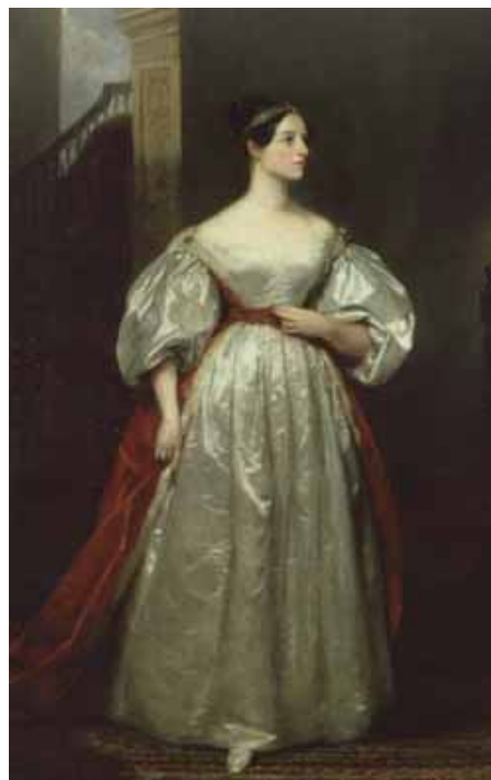
Ada Augusta, Countess of Lovelace

between intervals of greater or less extent , all other series which are capable of tabulation by the Method of Differences.